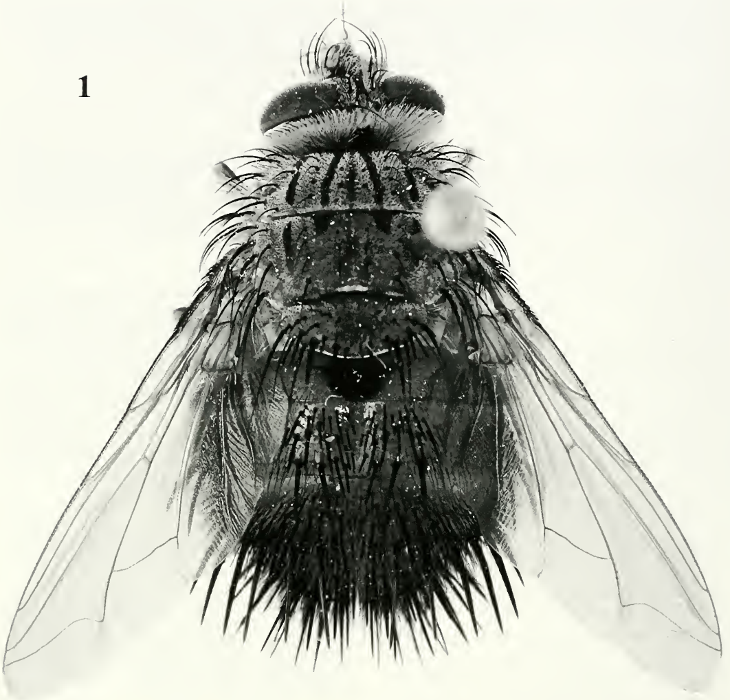
Fig. 1. Dorsal habitus of male of Jurinella baoruco .

and below them, and upper setae of postocular row black, all other setulae and larger setae golden yellow; parafacials setulose; frons at vertex 0.26–0.32 head width; without proclinate orbital setae; antenna orange yellow, sometimes parts of basal flagellomere irregularly darker, arista brown; first two aristomeres subequal in length, each about 3 times longer than its diameter; scape and pedicel with black setae; palpus dark yellow, laterally flattened, inner surface bare, with short black setae mostly confined to dorsal side, a small